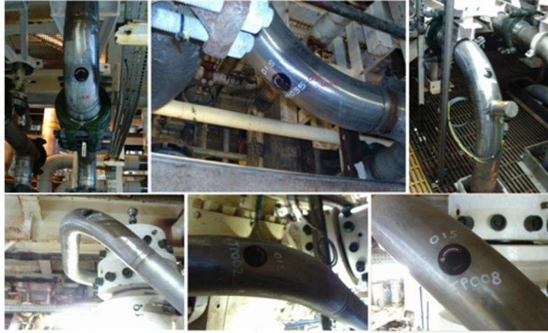
Examples of sensors installed on some wellhead flowline elbows