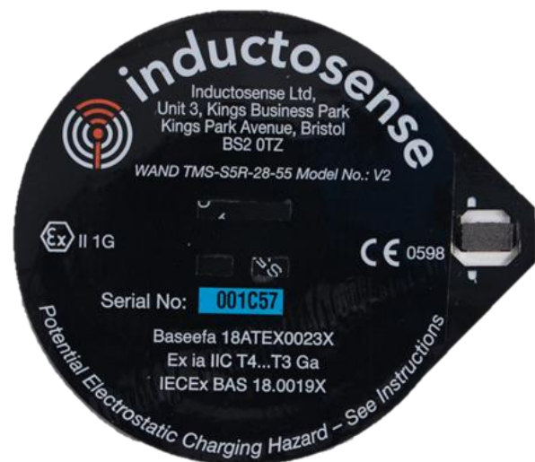
TM sensor (offset)