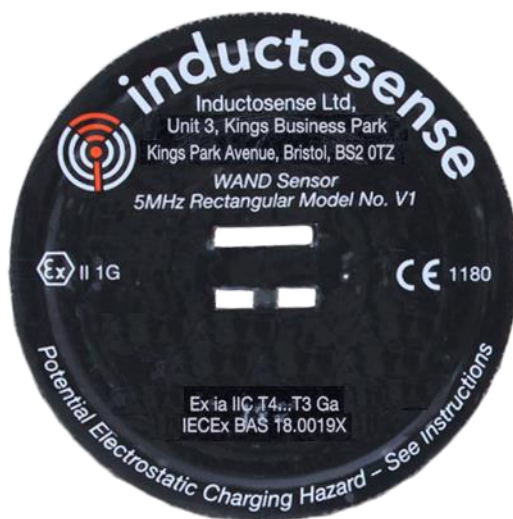
TM sensor (standard)

Inductosense offers the standard TM sensor , where the piezo crystal is in the centre of the sensor, or alternatively the offset TM sensor , where the piezo crystal is offset to the side for monitoring next to welds, etc.